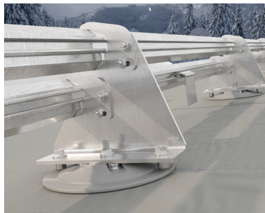
Double-rail Snow Titan™ for membrane

ACE CLAMP ® Innovative Roofing Solutions™