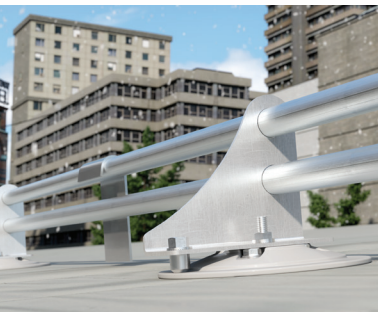
2-bar for membrane