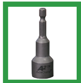
9/16" & 7/16" hex socket & adaptor for screwgun