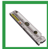
chalk line or laser