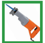
Sawzall to trim excess length of rail