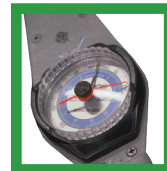
Dial indicator torque wrench