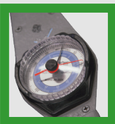
Dial indicator torque wrench