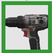
1/4" Hex Driver