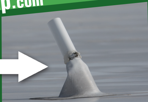
above: Vent damage from typical snow loads

Existing products for low sloped roofs can require large holes to be cut through the top membrane, removal of insulation down to the substrate and installation of wood blocking. Brackets are then attached to the blocking and additional flashing must be installed, in hopes of providing a leak-proof assembly.